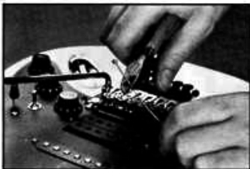
FIGURE SG 1

If using standard strings, remove ball ends with wire cutters. However, we suggest using the specially designed Floyd Rose Electric Guitar Strings that eliminate having to cut off the ball ends. Fig. SG 1.