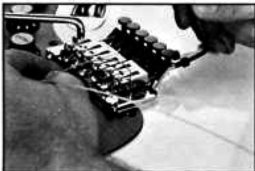
FIGURE SG 2

*Note: Strings are loaded into clamping saddles from the TOP .