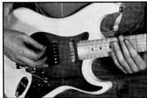
FIGURE HT 2