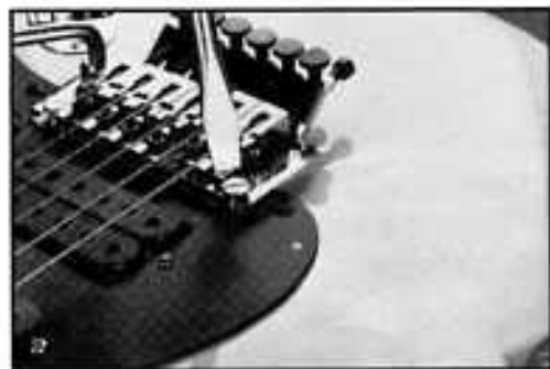
FIGURE BT 2