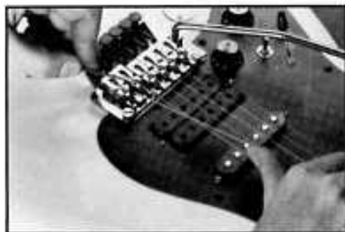
FIGURE HT 1

*Note: Under each saddle you will find three (3) threaded holes. This is to provide increased harmonic tuning range if needed. Once saddle has been moved to desired position, retighten hex screw Fig. HT 1 and retune string, then recheck harmonic tuning. Fig. HT 2.