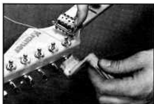
FIGURE SG 4