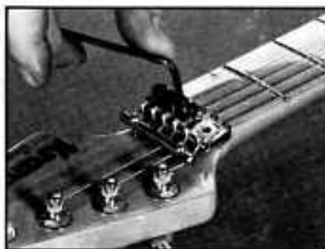
FIGURE SG 5