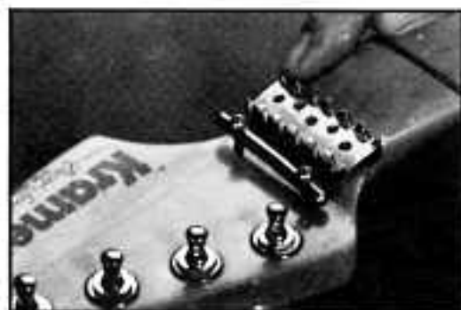
FIGURE SG 3

*Note: When putting on all new strings, passing strings over the nut is made easier by removing string locking elements as also seen in Fig. SG 4.