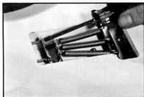
FIGURE BT 1

To make the bridge baseplate hover parallel to the face of the guitar, the string tension and the spring tension must be balanced. Once strings are tuned to pitch, if the baseplate is tilting back toward the face of the guitar loosen spring claw screws Fig. BT 1 and retune strings. If the baseplate is tilting forward or away from the body tighten spring claw screws Fig. BT 1 and retune strings. This procedure should be repeated until the baseplate is parallel to the body. When bridge tilt is in desired position bridge height or string action may be adjusted by raising or lowering rocker screws Fig. BT 2. If proper string action cannot be reached with only slight adjustment of rocker screws, the neck should be removed and the neck shim altered to reset the tilt of the neck.