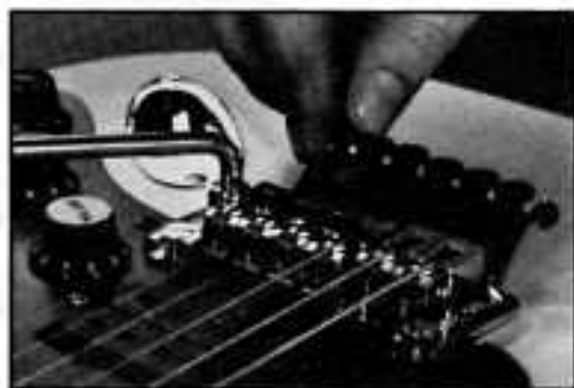
FIGURE SG 7

Retune strings with fine tuning thumb screws on bridge. Fig. SG 7.