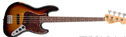
300 (3- Color Sunburst)

Like classic cars or your favorite T-shirt, some things just get cooler with age. It's especially true of electric basses—they develop an unmistakable mojo over time that only makes 'em look even cooler and feel even more comfortable than when they were brand new. That said, Fender's new Road Worn '60s Jazz Bass guitar was designed with 1960s specs and a nitrocellulose finish to deliver that killer aged look, feel and mojo without breaking the bank. A true player.