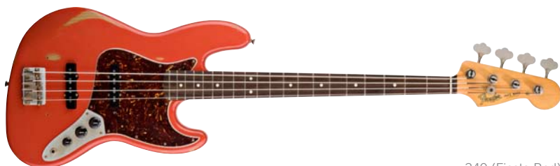
340 (Fiesta Red)