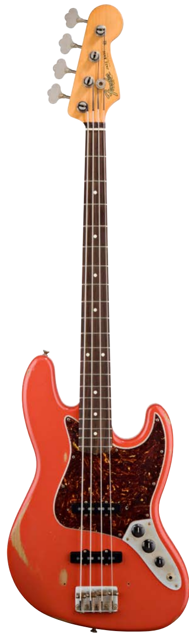
40 (Fiesta Red)

Unique Features Distressed body, neck, and hardware creating aged appearance.